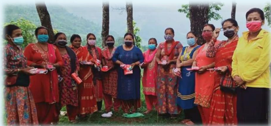
Members of the women group in Phalewas, Ward 6 operated under Rahale Branch, Parbat District

The number of Centres increased by 34 reaching to a total of 22,573. While the number of active clients increased by 588 reaching to a total of 403,002; the number of loan clients decreased by 1,996 dropping to a total of 235,425.