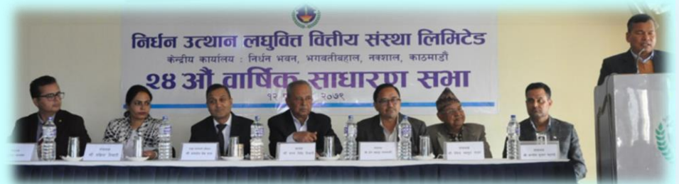
Nirdhan Utthan Board of Directors attending the 24 th Annual General Meeting