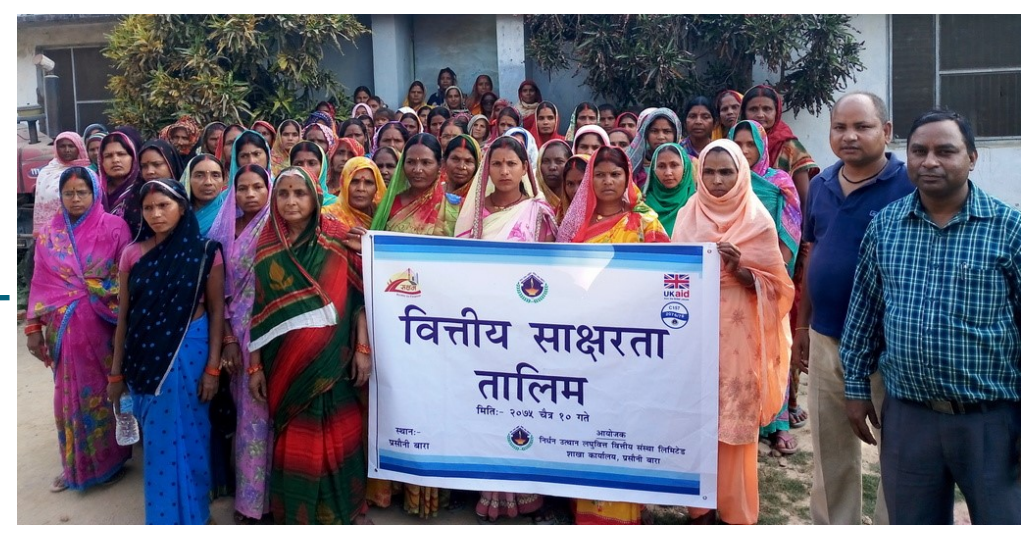
Participants of Financial Literacy Training organized by Prasauni Branch, Bara District

branch offices within Birgunj Regional Office. These programs provided financial literacy to 893 members of Nirdhan. The financial literacy trainings are focused to provide much needed basic knowledge on financial services available to them and the benefits of proper utilization of these services. The main topics discussed during the training program included Savings services, Loan Services, Long term pension