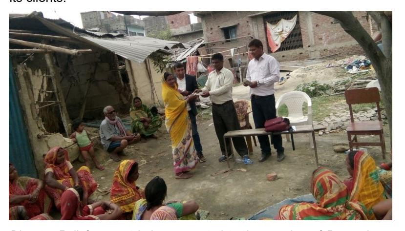
Disaster Relief amount being presented to the member of Parwanipur Branch, Parsa District affected by Tornado.

Alongside, maternity allowances & reliefs, Nirdhan also distributes compensations in the event of death or accidents of its member clients to their family who were insured through the micro-insurance service facilitated by Nirdhan Utthan LBSL. Nirdhan distributed 84 compensations in the month of Mar-Apr 2019 (Chaitra 2075) amounting to a total of Rs. 4.70 million to the family of deceased clients through its different branches across the country. Nirdhan Utthan provides the insurance facilities to its clients through co-operation with the best value major insurance company in the market. The insurance premiums charged to the clients are negotiated by Nirdhan to offer value without compromising on the benefits offered by the insurance to its clients.