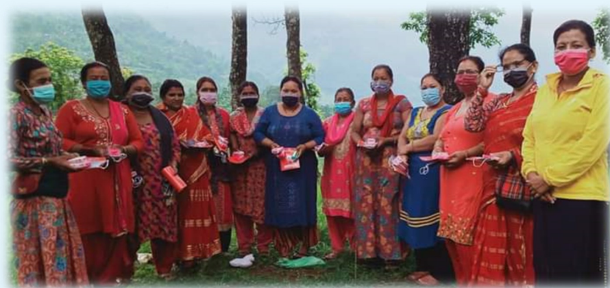
Members of the women group in Phalewas, Ward 6 operated under Rahale Branch, Parbat District

The number of Centres increased by 34 reaching to a total of 22,573 . While the number of active clients increased by 588 reaching to a total of 403,002 ; the number of loan clients decreased by 1,996 dropping to a total of 235,425 .