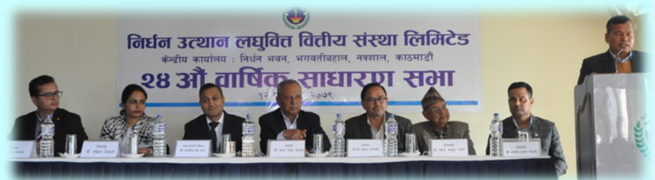
Nirdhan Utthan Board of Directors attending the 24 th Annual General Meeting