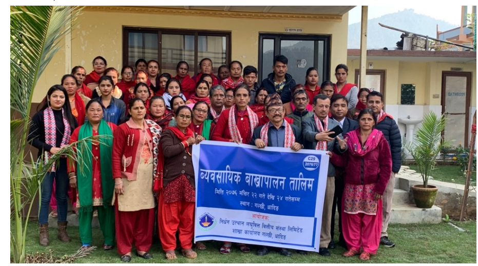
Participants of Commercial Goat Farming Training organized by Galchhi Branch, Dhading District