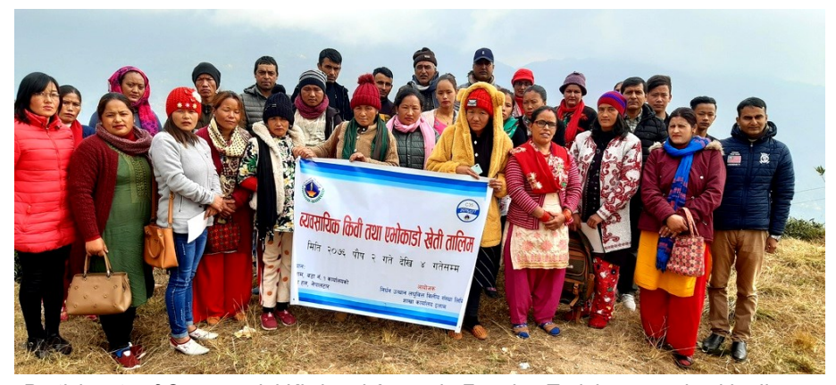
Participants of Commercial Kiwi and Avocado Farming Training organized by Ilam Branch, Ilam District

The branch offices play a very important role in facilitating these training programs. They collect the client need identification and request for the training specific to the clients need in their operating area. This process has increased the efficiency of these trainings as well as the overall impact that has been achieved through the programs organized. The clients who obtain these trainings have shown great difference from the traditional and less productive way they did their agriculture and businesses in the past. The regular training programs are important contribution to the clients.