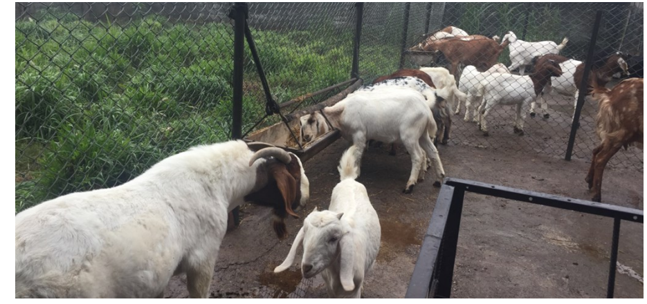
Goat Farm observation during the training organized by Daunnedevi Branch, Nawalparasi District