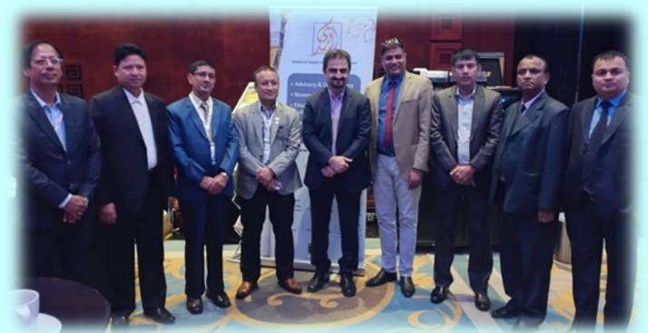
Nirdhan delegates with fellows in UAE Forum - August 2022

The Forum and post-event workshops were organized for development of insurance industry and operations complying with the sharia laws, drawing upon lessons from conventional insurance system.