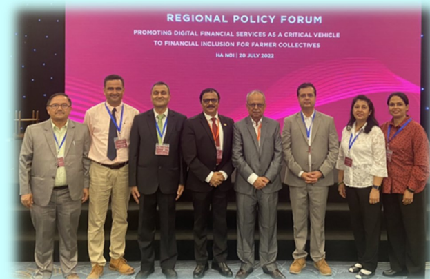
Nirdhan Directors in a policy forum on Digital Financial Services organized by APRACA in Vietnam ~ July 2022

Nirdhan continued to participate in national and international events, also for its capability enhancement. While Nirdhan Board and Managers took part in regional and global forums, the Officers will be on a foreign study tour soon. Likewise, all Branch Managers were covered through one-day training events.