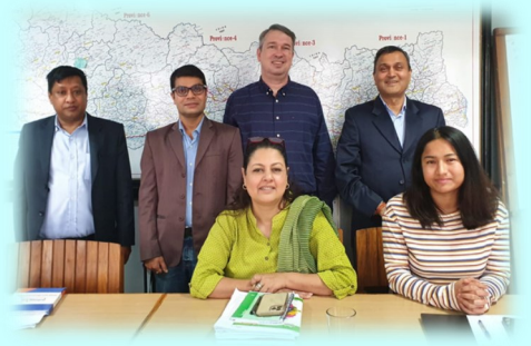
Visiting teams from ADB (left) and FWEAN, Care and Alpha Wolff Consulting at Nirdhan