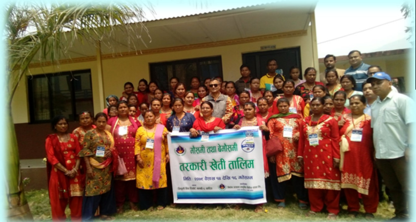
Client Capacity Building - April 2022

In terms of regional office coordination for the capacity building activities, Birendranagar handled 3 events followed by 2 events each by Birgunj and Bardibas, and 1 event each by Attaria and Bharatpur.