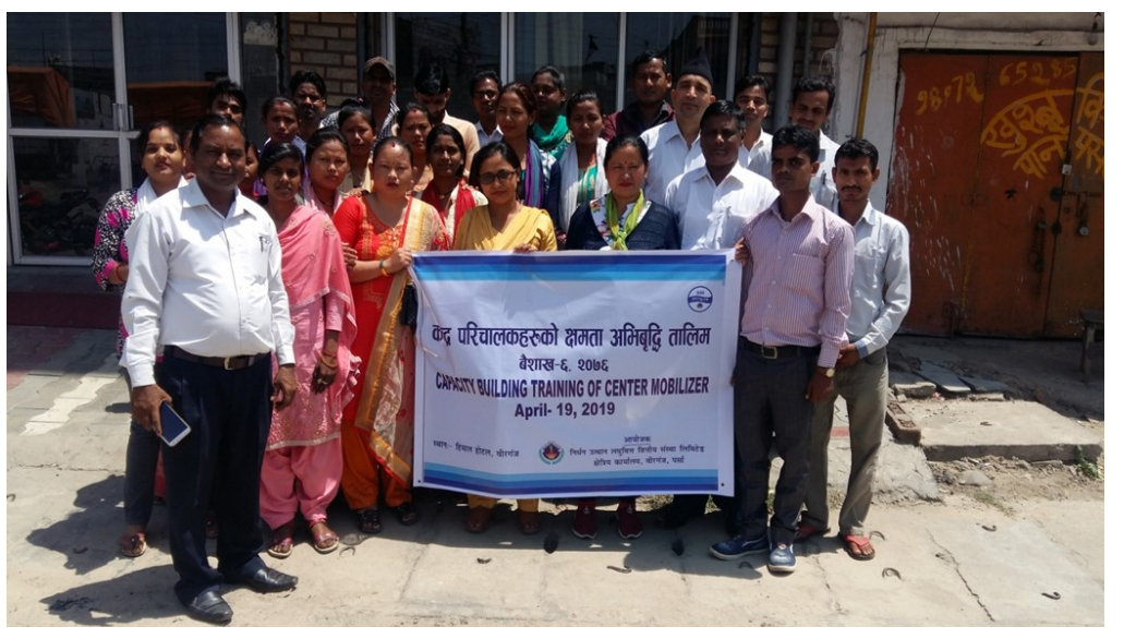
Participants of Center Mobilizer Capacity Development Training organized by Birgunj Regional Office, Parsa District.

the branch managers and the workshop helped to identify targets for the next fiscal year and assess the achievement