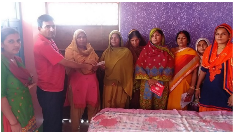
Compensation amount being presented to the family of the deceased client of Birgunj Branch, Parsa District .

Alongside, maternity allowances & reliefs, Nirdhan also distributes compensations in the event of death or accidents of its member clients to their family who were insured through the micro-insurance service facilitated by Nirdhan Utthan LBSL. Nirdhan distributed 137 compensations in the month of Apr-May 2019 (Baisakh 2076) amounting to a total of Rs. 10.20 million to the family of deceased clients through its different branches across the country. Nirdhan Utthan provides the insurance facilities to its clients through co-operation with the best value major insurance company in the market. The insurance premiums charged to the clients are negotiated by Nirdhan to offer value without compromising on the benefits offered by the insurance to its clients.